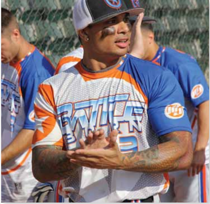
Page 58 • www.batwars.com • www.softballmag.com