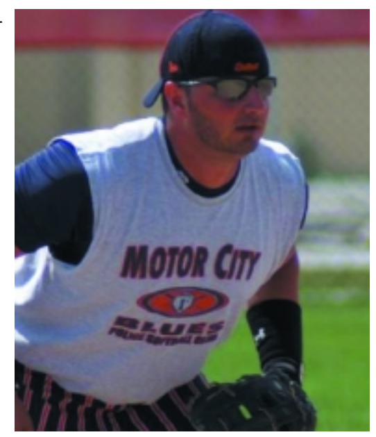
What impact will the new Motor City Blues have on the circuit? Only time will tell

Maryland, Palm Springs Desert Classic, South Lake Tahoe, Star-Six